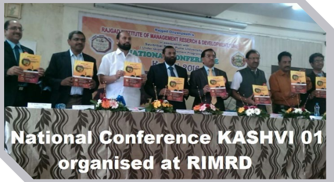
National Conference KASHVI 01 organised at RIMRD